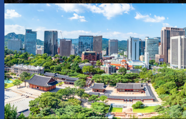
A Harmony of Old and New

Seoul is the capital of the Republic of Korea where tradition and trends coexist, and a global tourism city that offers endless inspiration and excitement to travelers from around the world as the heart of K Culture.